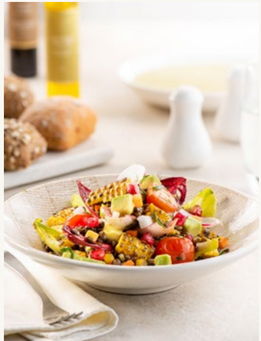
LENTIL ROASTED CORN

Scottish smoked salmon and avocado with marinated beetroot, horseradish crème and a honey mustard vinaigrette.