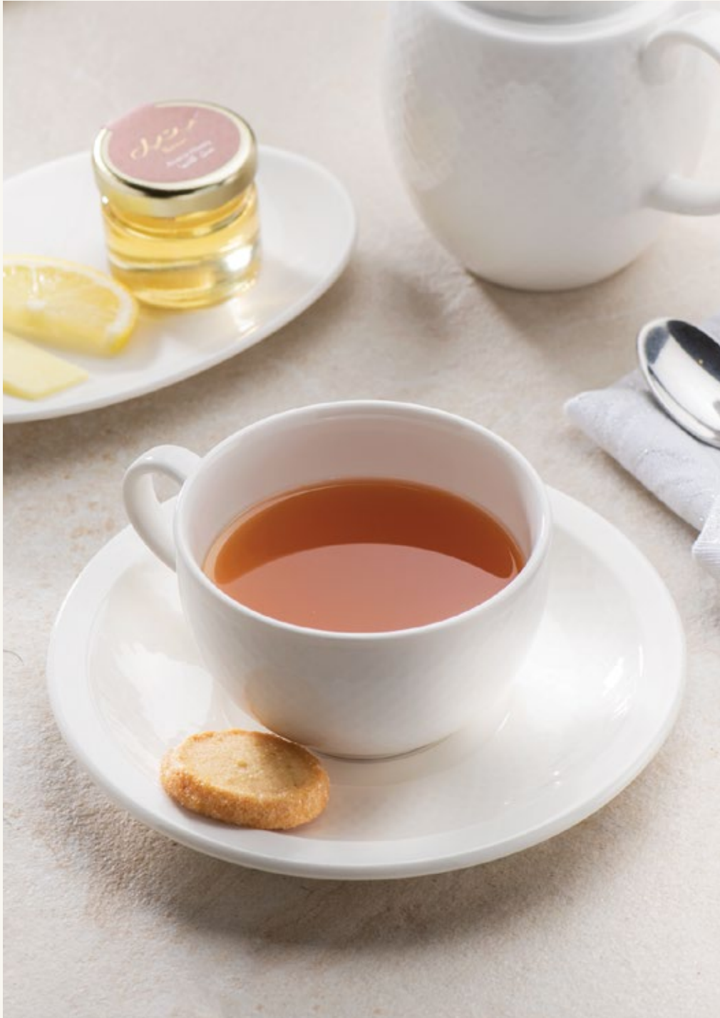
LEMON & GINGER

Our curated collection of speciality teas has been ethically sourced from single gardens in the world's premier regions.