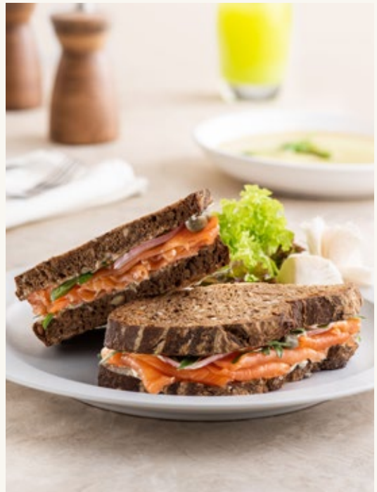
SMOKED SALMON RYE