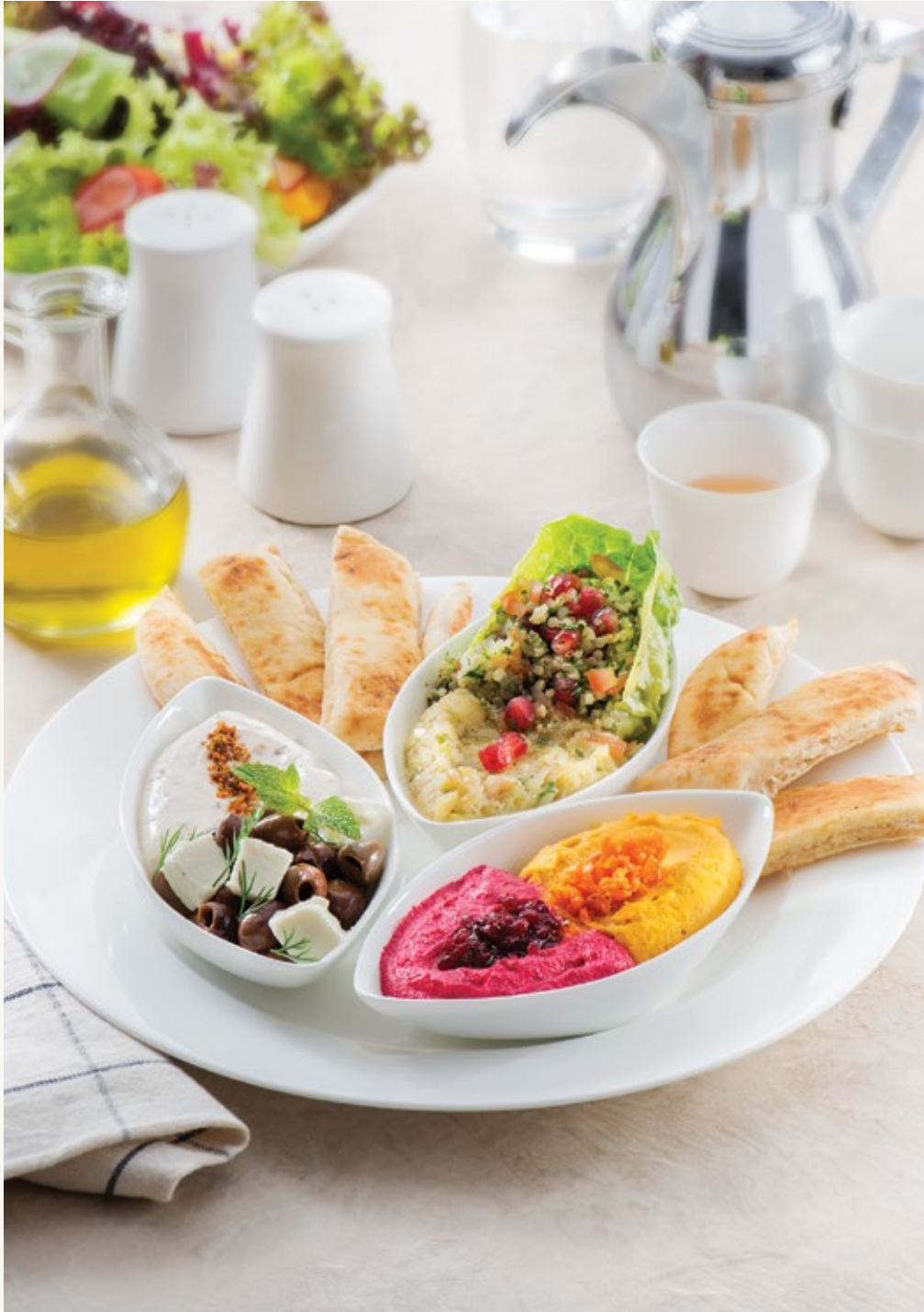
BATEEL MEZZE PLATE

Our selection of wholesome soups and sharing plates are served with homemade bread, freshly prepared by our artisan bakers.