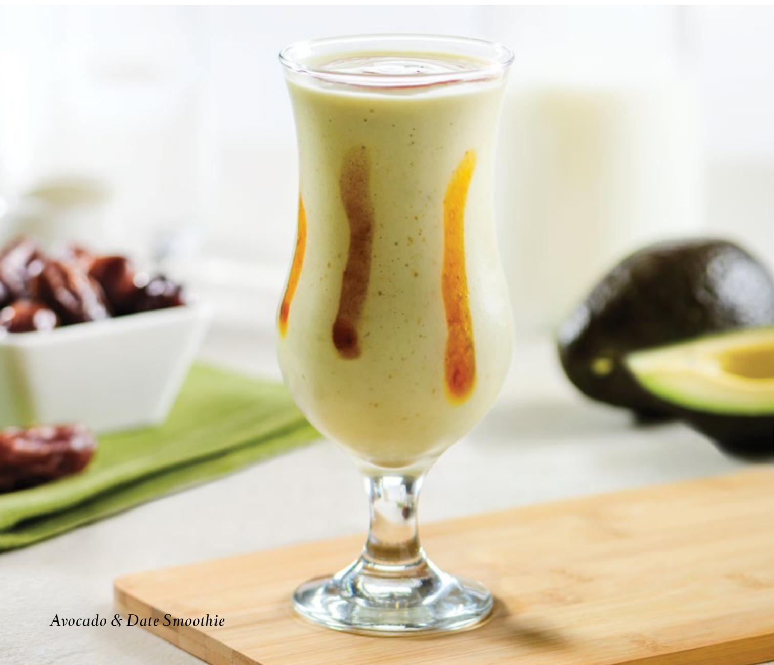
Avocado & Date Smoothie

Deliciously fresh Australian avocados blended with Bateel's finest organic rhubarb dates.