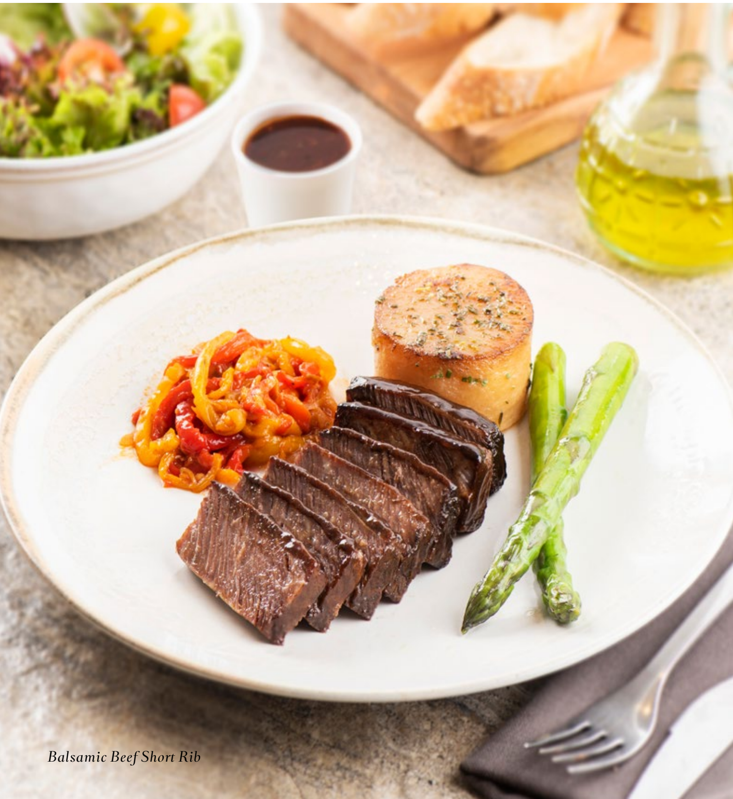
Balsamic Beef Short Rib