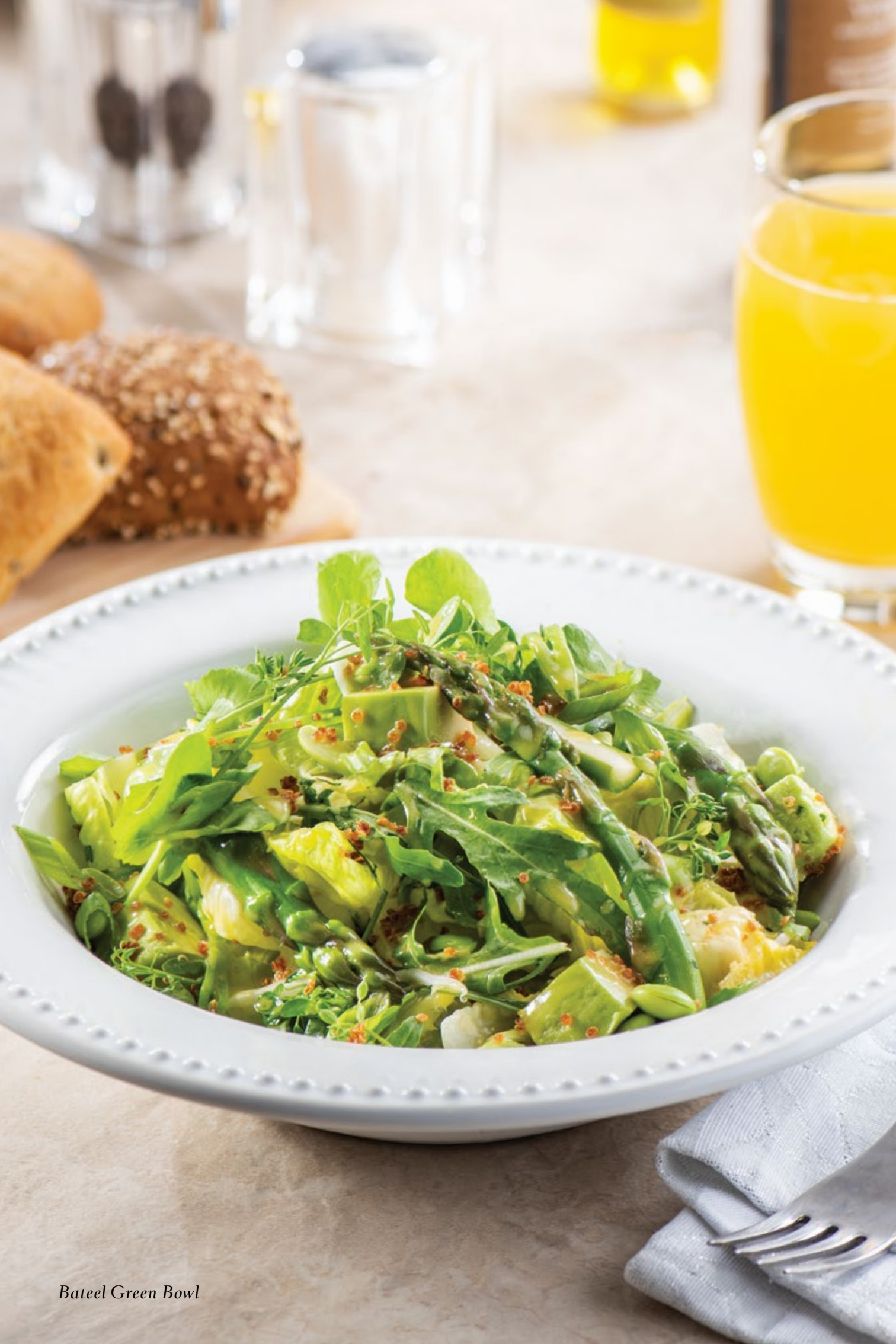
Bateel Green Bowl