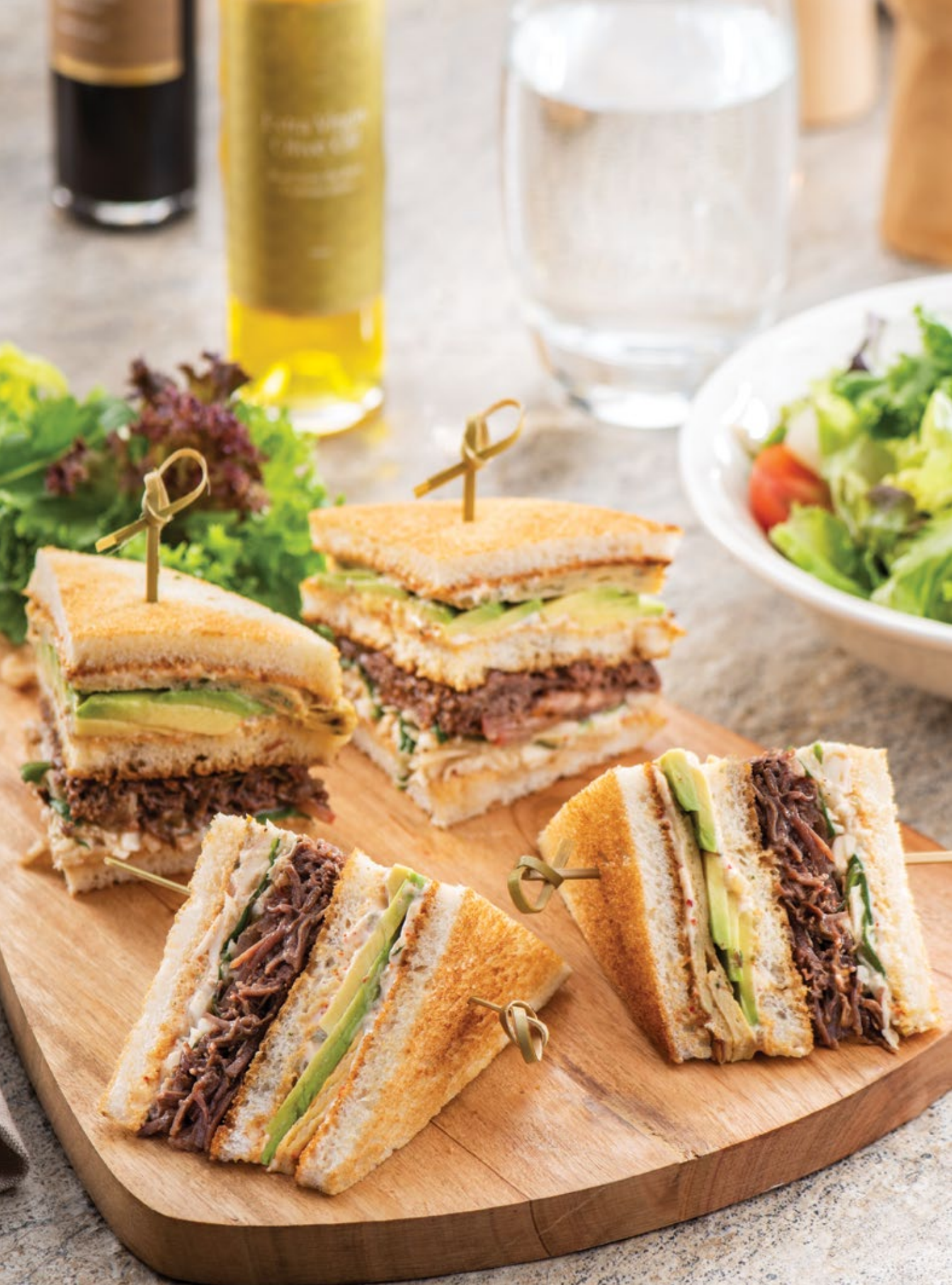
Beef Short Rib Club