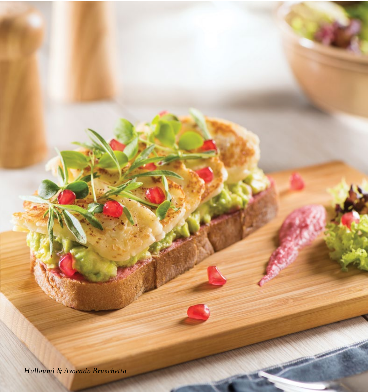
Halloumi & Avocado Bruschetta

Grilled halloumi with avocado on crunchy bruschetta, with zaatar, sumac, beetroot hummus and lemon.