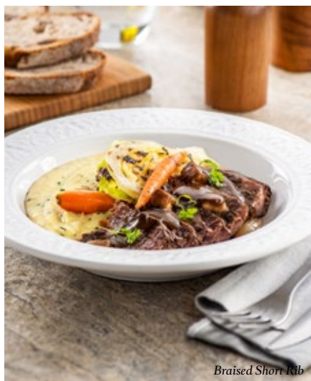
Braised Short Rib