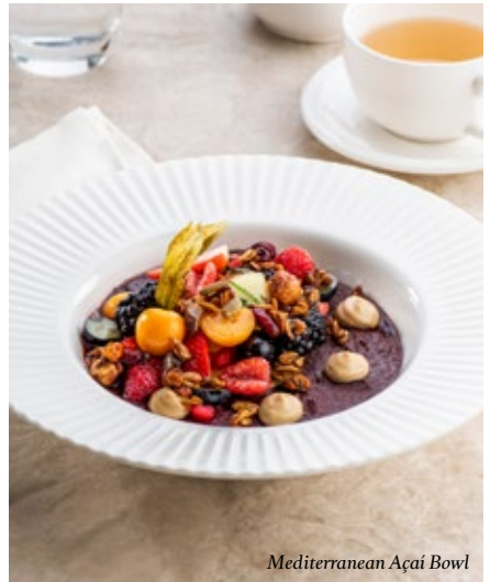
Mediterranean Açai Bowl