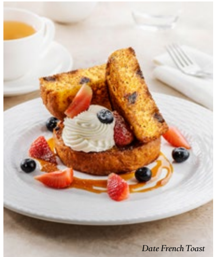
Date French Toast

Scrambled eggs enveloped in a roasted red pepper piperade and labneh, served on toasted sourdough.