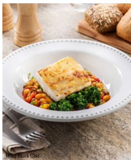
Wild Black Cod

Pan-roasted seabass fillet with lightly spiced aubergine, tomato basil coulis, shaved fennel salad and a cucumber and dill Greek yoghurt.