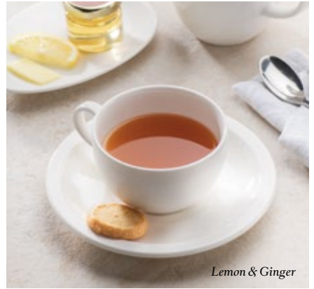
Lemon & Ginger