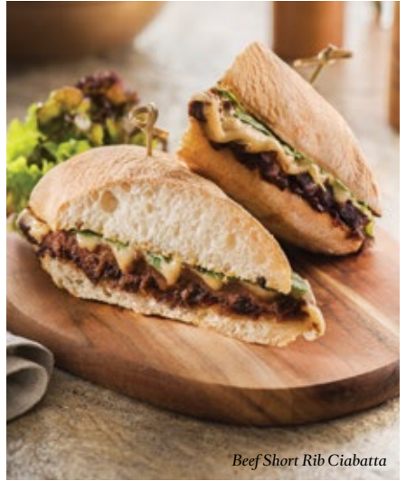
Beef Short Rib Ciabatta

Fresh grilled halloumi, aubergine, peppers, artichoke, avocado, pomegranate and baba goush, served with garden greens.