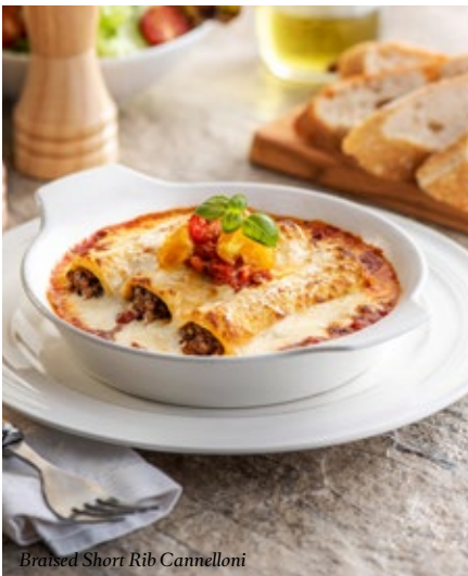
Braised Short Rib Cannelloni