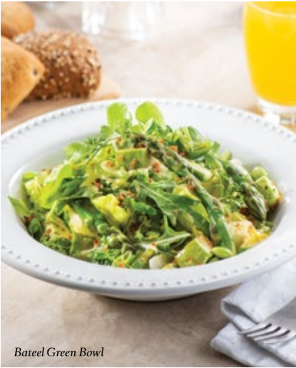
Bateel Green Bowl