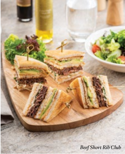
Beef Short Rib Club